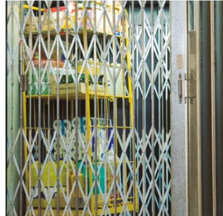
Lift car folding doors: manual picket gates