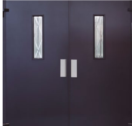
Lift landing doors: manual (standard)