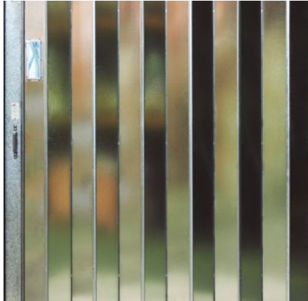
Lift landing folding doors: manual shutter gates